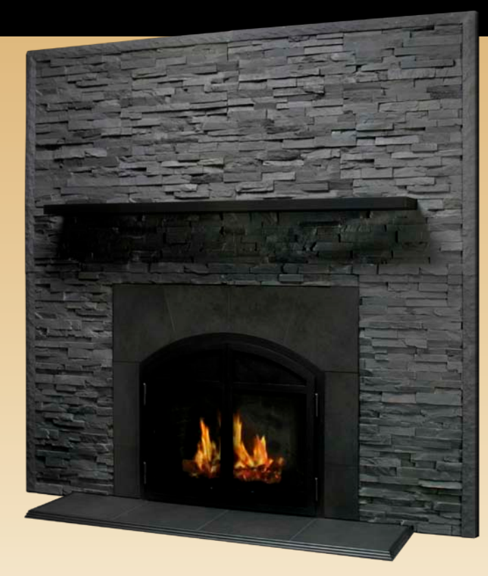
Combine Wingstone Wallscape panels with our custom tile fireplace surrounds for a fast, efficient installation with a coordinated look.