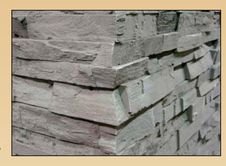
Quick & Easy Installation