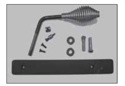
Hardware package Double Doors