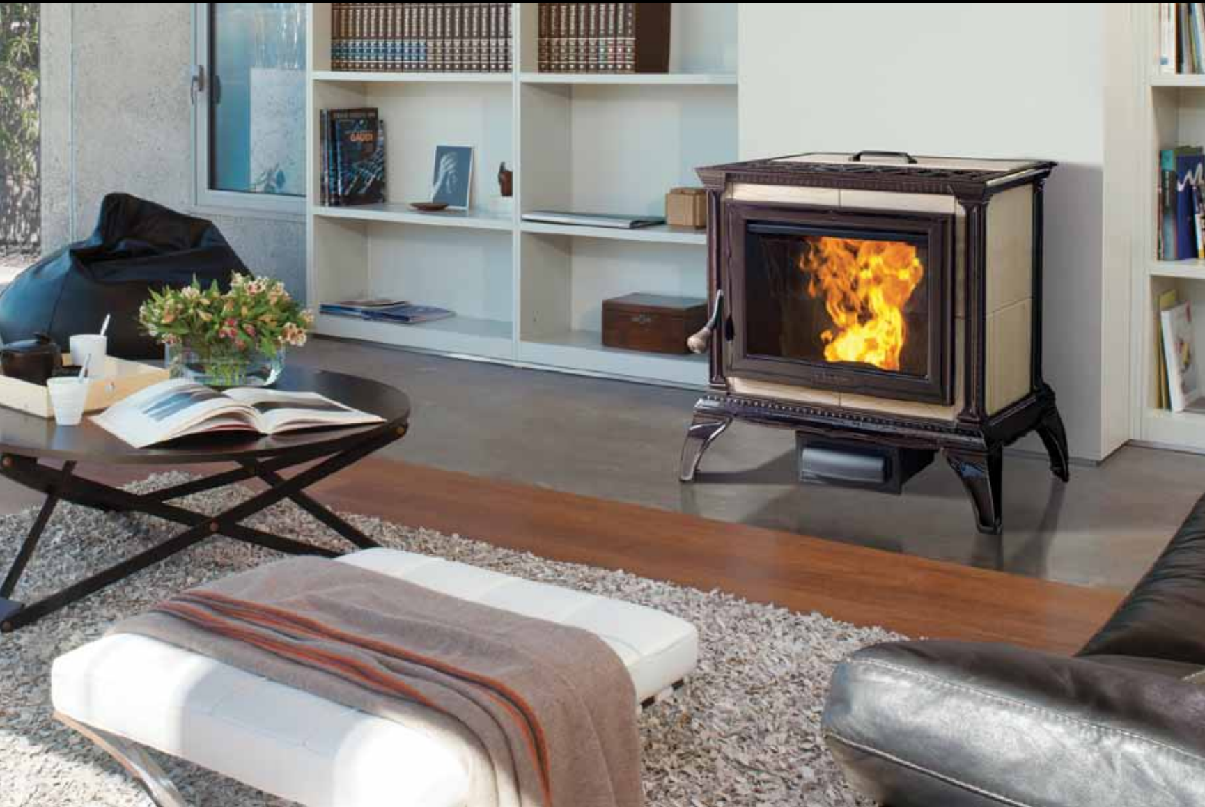
Heritage Pellet featured in Brown Majolica Enamel and Sahara Sandstone.