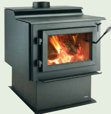
WS22 wood-burning stove