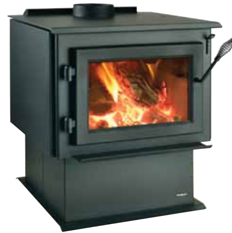
WS18 wood-burning stove

Manufactured in the USA, by the world's leading hearth company since 1927—known for value and dependability.