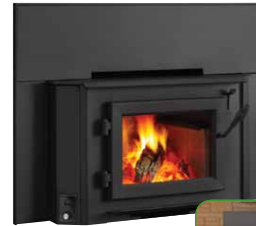
WINS18 wood-burning insert